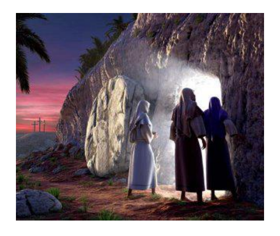
"Early" Easter Sunday - April 4 - 7:00 a.m.

Please join us for worship ... "in the sanctuary" ... OR by "Facebook Live" video ... OR on "90.5" FM